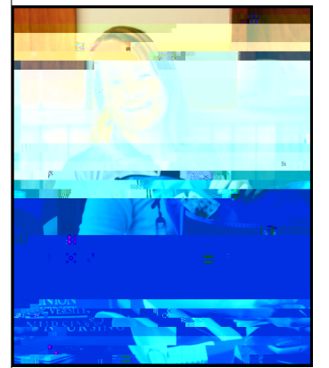
A "Resource Mother" showing off her ODU Nursing Bag.